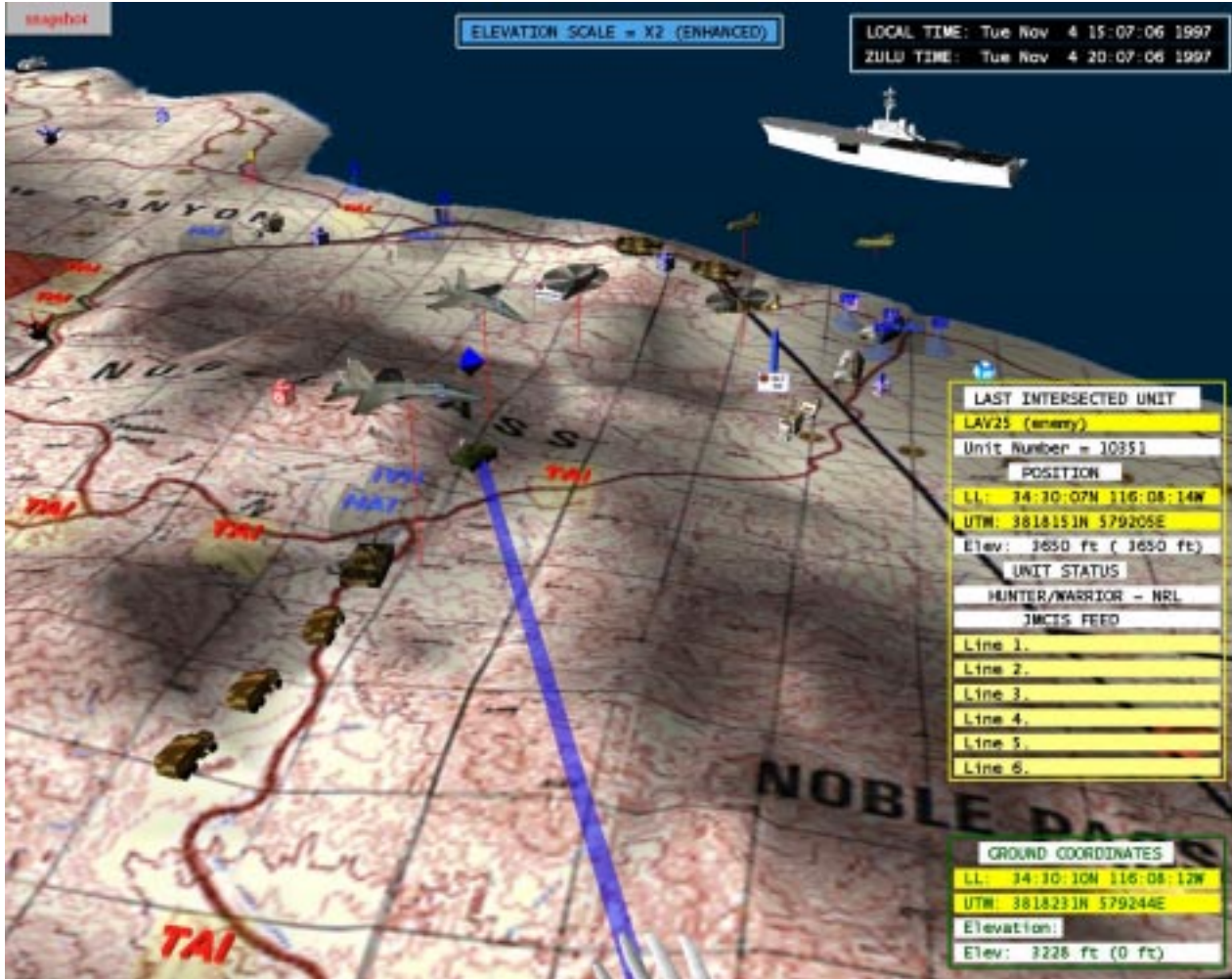
Figure 1: Screen shot from the Dragon battlefield visualization virtual environment.

the battlefield visualization VE described herein (see Section 4.3 and Section 5).